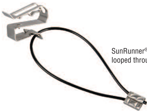
SunRunner® EZ with (optional) SunBundler (page 1-11) looped through slot